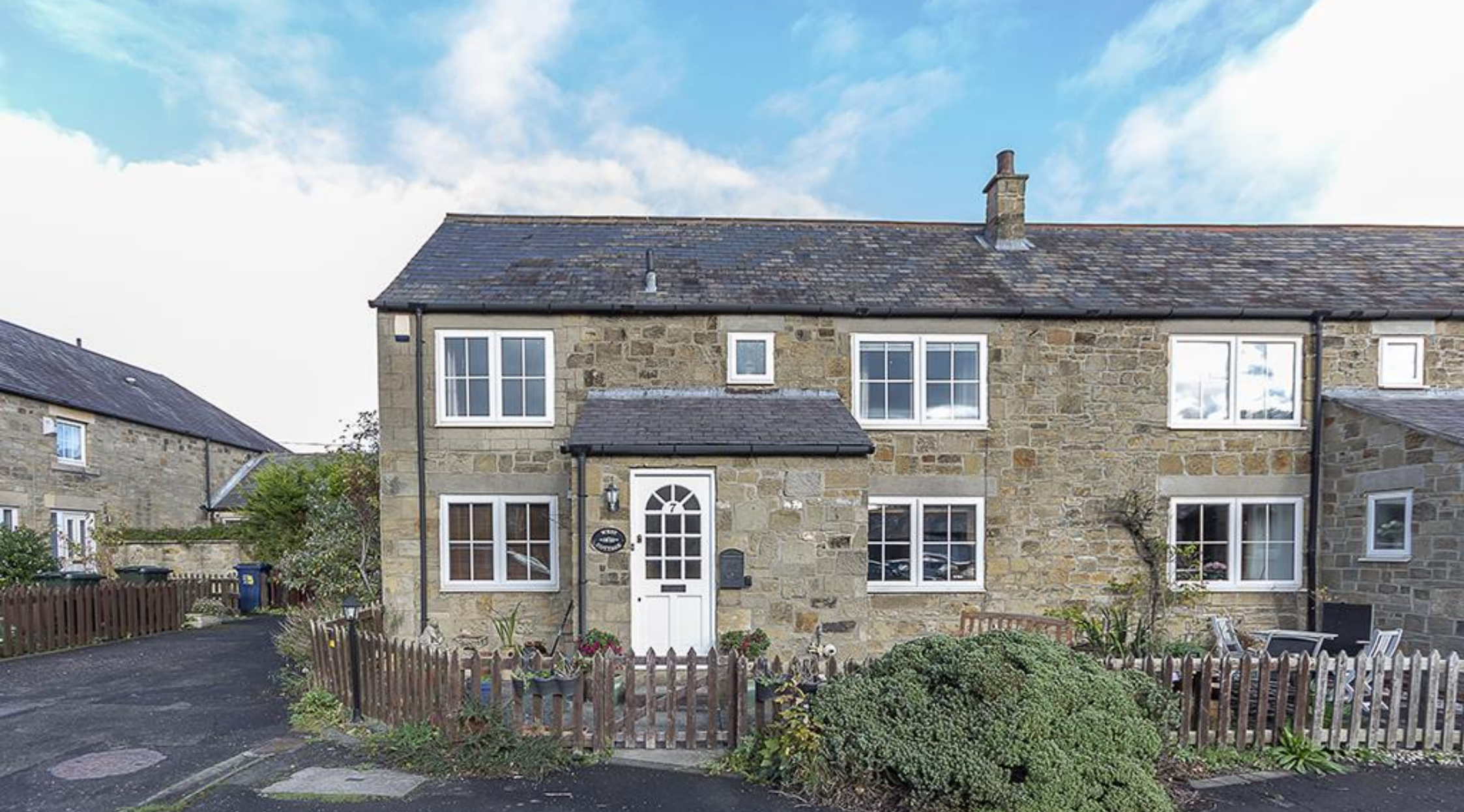
7 Brunton Mews Brunton Lane